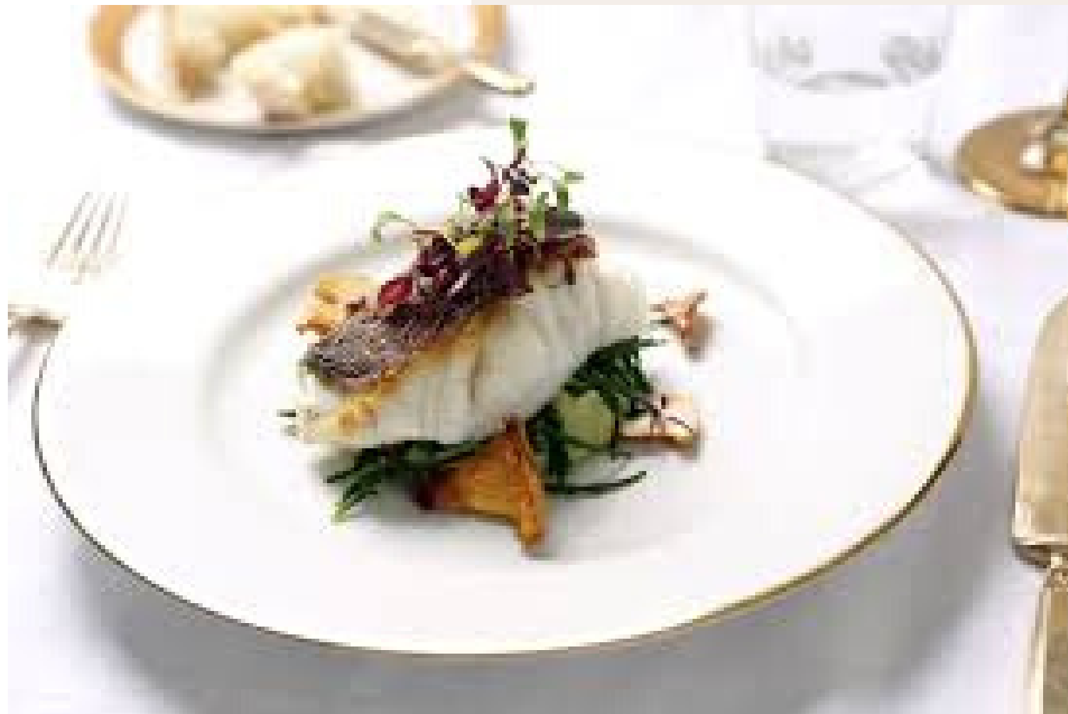
Crispy Skin Local Seabass, Sauteed Seaonal Vegetables

Choose from our either our invidually plated menu or our sharing platters