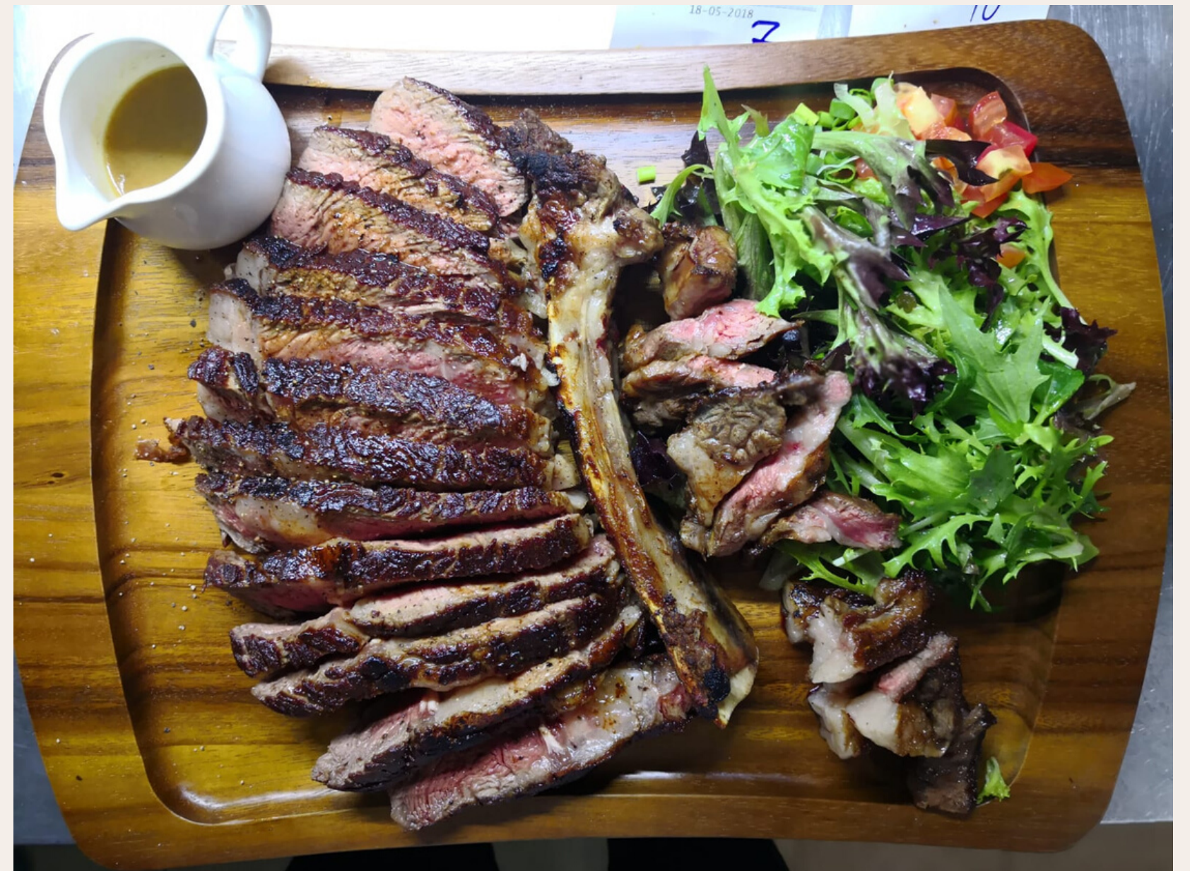
120 Day Black Angus AUS Tomahawk. best enjoyed with friends